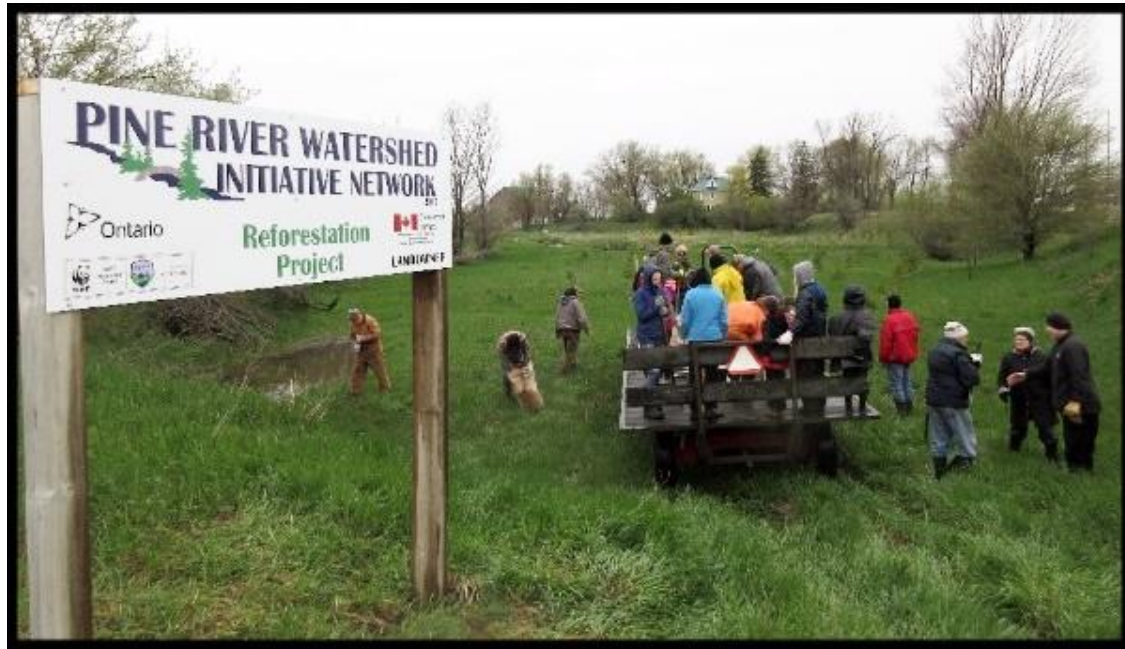
ALL ABOVE: 4H Conservation Club of Ripley, members of the Huron Fringe Field Naturalists, and PRWIN members on the planting site Saturday May 6th.

Remaining seedlings were both hand and Tree Tractor planted by PRWIN Directors and staff at specific projects sites funded by OCEF (Ontario Community Environment Fund) and Bruce Power! Look for our coverage on Facebook, our new website (see launching announcement below!), and Summer and Fall Enewsletters for updates on these exciting restoration projects.